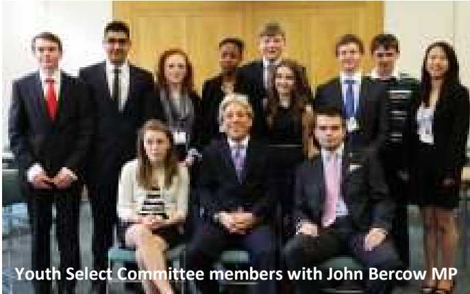
Youth Select Committee members with John Bercow MP