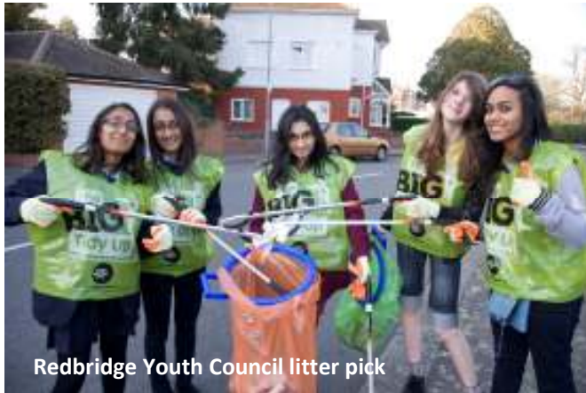
Redbridge Youth Council litter pick

The Redbridge Youth Council have been working on their In Youth We Trust Campaign. The campaign was launched with a Youth Appreciation Fortnight from March 19 - 30. The campaign consisted of posting random acts of kindness on the Redbridge Youth Council Facebook page, a planned act of kindness which was a litter pick in a local park (just prior to the Queen's Visit) and a Red Accessory Day where students wore 1 red item and donated the