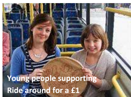
Young people supporting Ride around for a £1

Support worker -North Yorkshire Youth Council